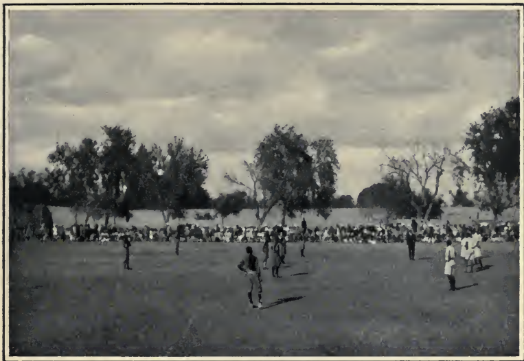
A FOOTBALL MATCH AT BANNU