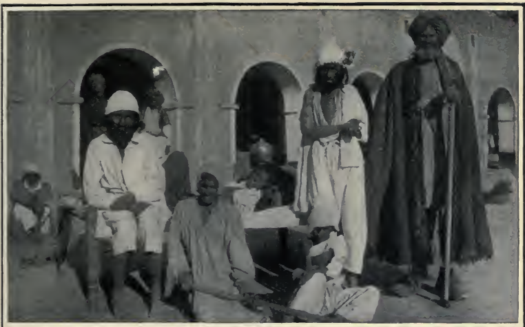
BANNU MISSION A group of Patients.