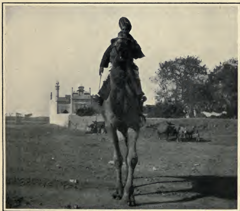
A CAVALRY SHUTUR-SOWAR OR CAMEL-RIDER

A village in the Pass belonging to independent Afghans, showing tower and fortifications.