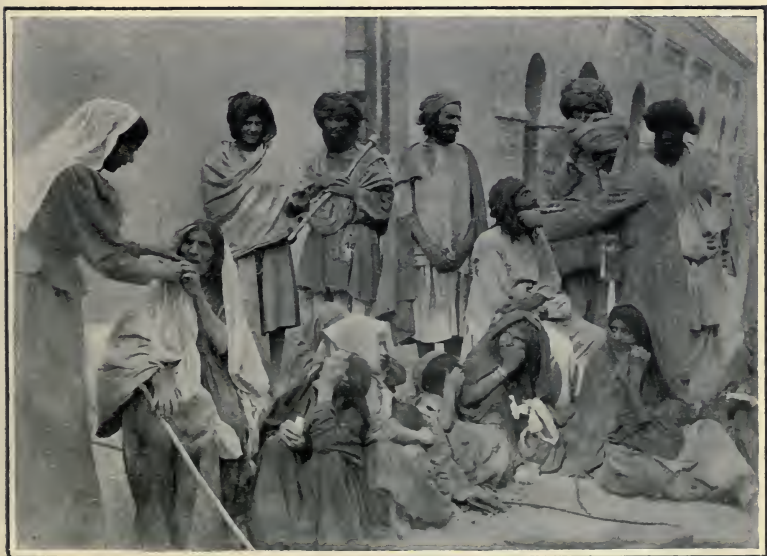
A GROUP OF OUT-PATIENTS AT THE MISSION HOSPITAL, BANNU