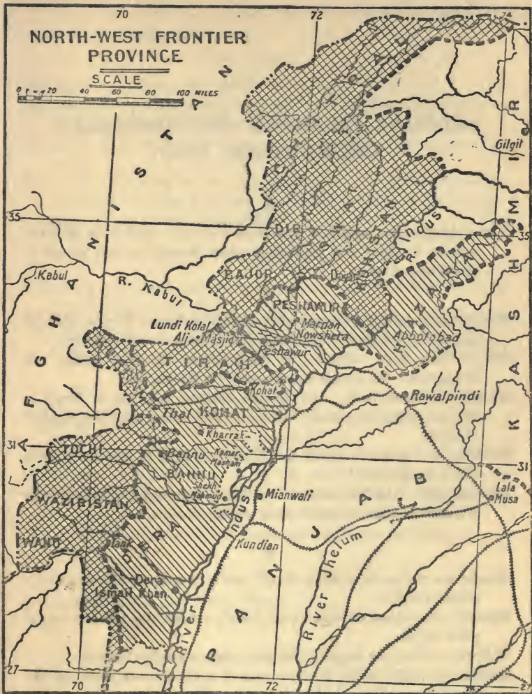
The light shading shows the North-West Frontier Province, and the darker shading (between the Durand line and the India Frontier) the territory of the independent and semi-independent tribes.