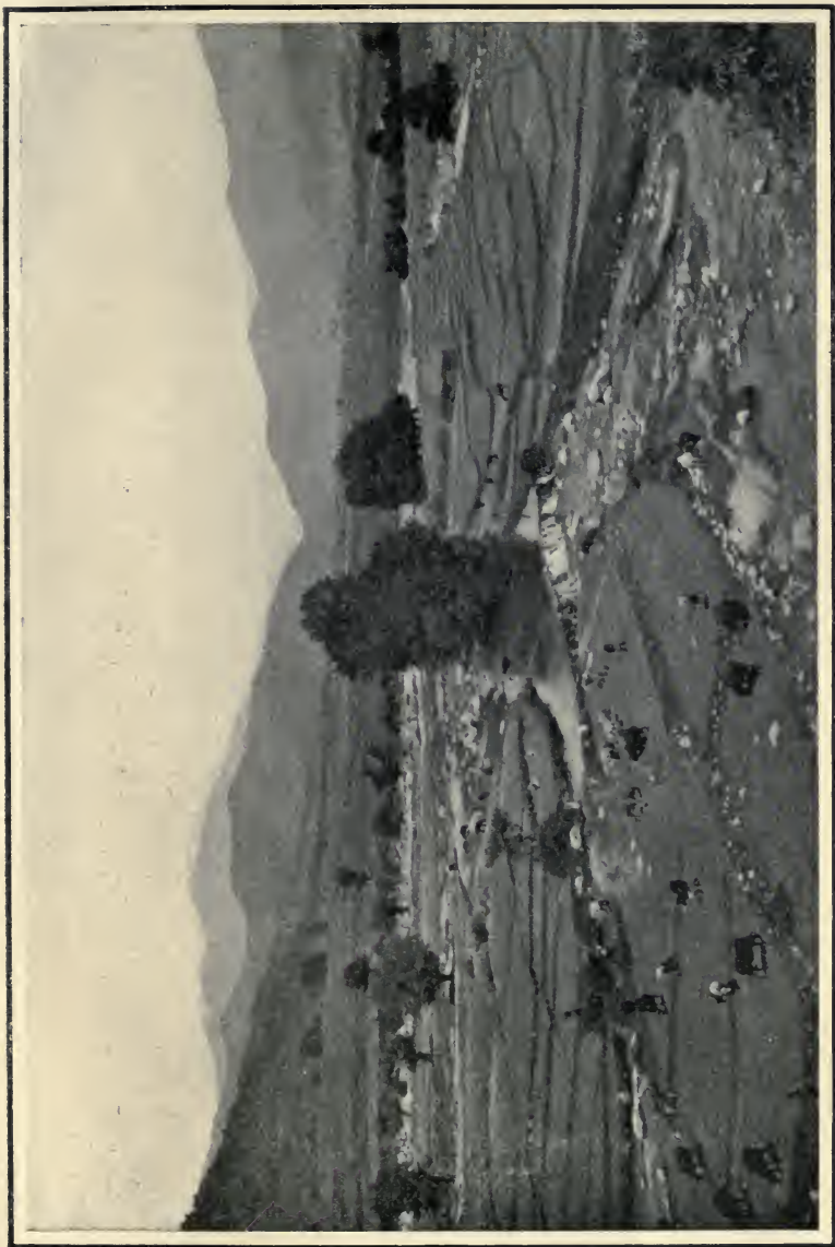
NEAR SHINKIARI, HAZARA DISTRICT Rice fields and irrigation, with cattle feeding.