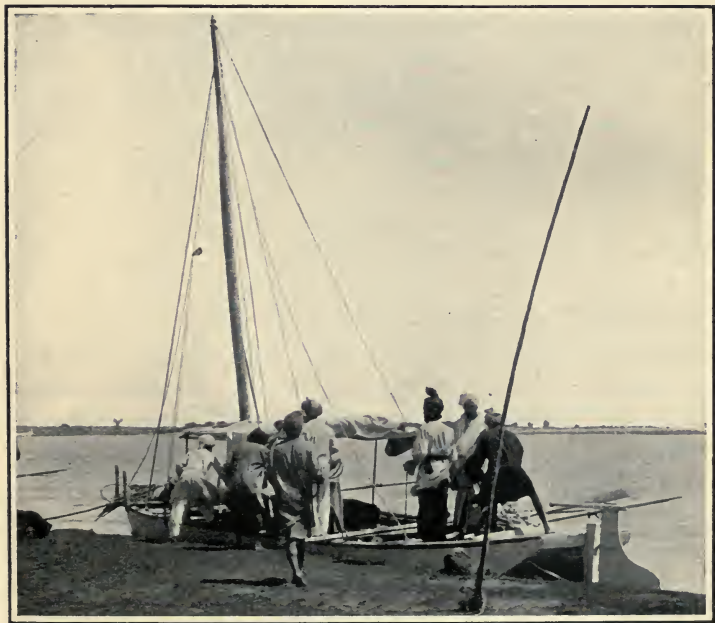
THE FERRY-BOAT FOR THE MAIL ON THE INDUS RIVER NEAR DERA ISMAIL KHAN

At this time the water covers the land for many miles to a depth of several feet.