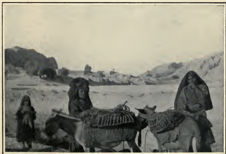
WATER-CARRYING AT SHIMVAH

Women bring the water, frequently from a great distance, in skins slung on either side of donkeys.