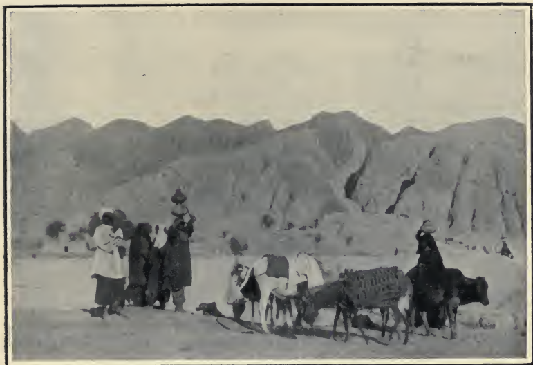
WOMEN GOING FOR WATER AT SHIMVAH