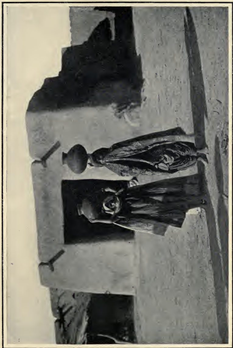
WOMEN CARRYING WATER-POTS