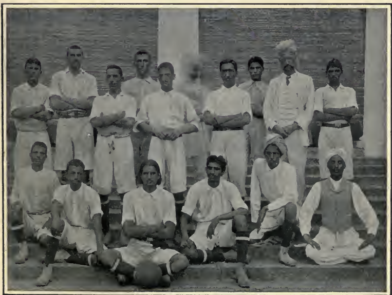
THE BANNU FOOTBALL TEAM Five of whom were nearly killed in Bombay.