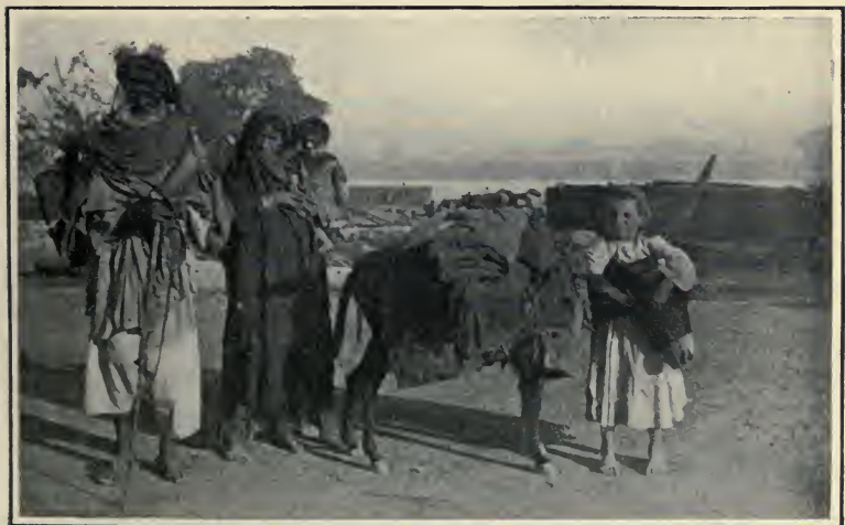
A TRANSBORDER AFGHAN BRINGING HIS FAMILY TO THE HOSPITAL

An old woman in the Peshawur Hospital describing how her grandson was shot in Tirah as the result of a blood feud. He was the last male representative of a clan which had been exterminated owing to the vendetta.